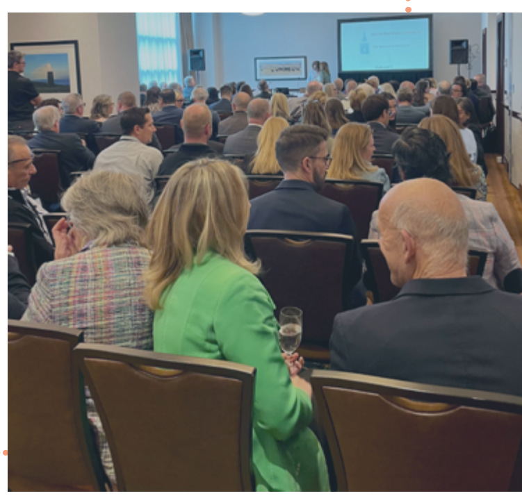
FEA Concurrent Session at Symposium 2024

The Family Business Symposium, a key event in our calendar, was held in Calgary from May 27 to 29. This year's theme was Impact which resonated with hundreds of Canada's family business leaders who attended. The Symposium delved into crucial post-pandemic transition strategies, the importance of mental health and resilience, the role of digital transformation in business sustainability and the complexities of navigating family dynamics in succession planning.