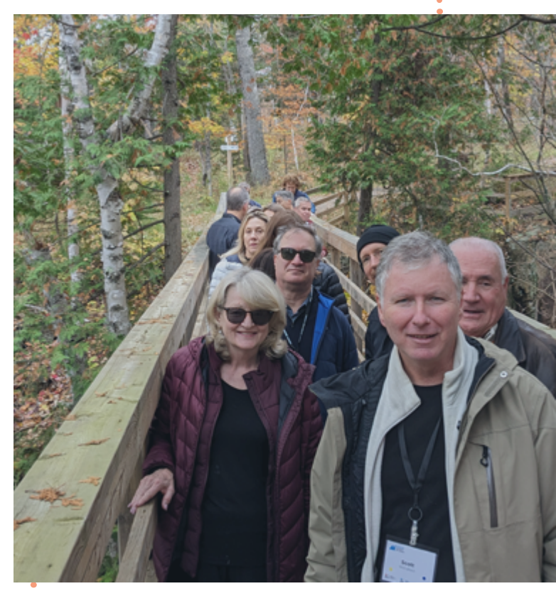
"Walkshop" up Mont Tremblant, Québec at Families Summit of Minds July 2024 | 6

Canada's family enterprises continue to profoundly impact the Canadian economy, contributing $574.6 billion to the country's GDP and providing millions with employment. This year, we've enhanced our advocacy and educational efforts to support these vital contributions, ensuring that family businesses remain a cornerstone of national prosperity.