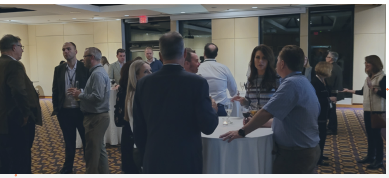
Cocktail and Social at the Kingbridge Conference Centre during FEA Forum near Toronto, Ontario

In Quebec, our collaboration with Espace ORIA has been instrumental in delivering custom family enterprise advisor education, focusing on "Business Family Dynamics." This partnership is dedicated to empowering Francophone professionals and enriching the advisory capabilities within Quebec's vibrant entrepreneurial community.