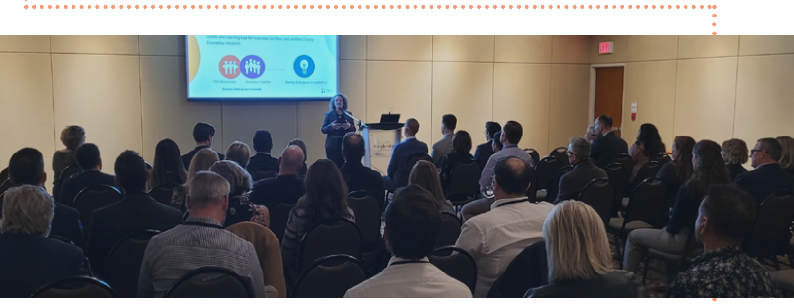
Announcements during FEA Forum near Toronto, Ontario